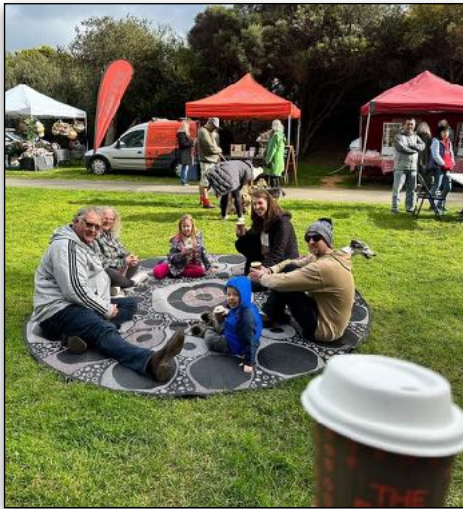
Typical Market scenery - family enjoying the sunshine, the music and of course, the coffee. Note the Brew Box van in the back ground. (Family on the mat is connected to the Brew Box).

Just a reminder that Cittaslow is selling natural cleaning liquid from the Cittaslow Corner and also from the Cittaslow stall at the Market. Currently we have bottles of Laundry Liquid, Body Wash, Dishwashing Liquid and Toilet Cleaner. Some of us started buying this when one of our stallholders was selling all natural and environmentally friendly products. When she left (family reasons) we decided to continue to supply some of these products. Come and try it and let us know what you think. Here is an example. We are recycling the bottles so please return the bottles and get a refill.