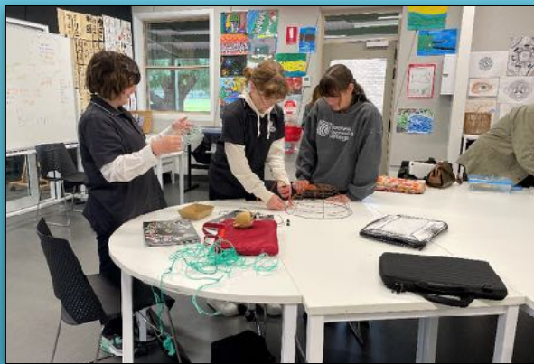
Making the jellyfish