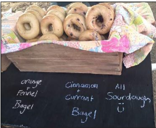
Sourdough bagels from Hey Bagels. Come and see the bread and the cinnamon scrolls at the Market.