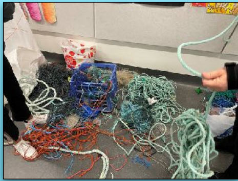
Cleaning and sorting materials