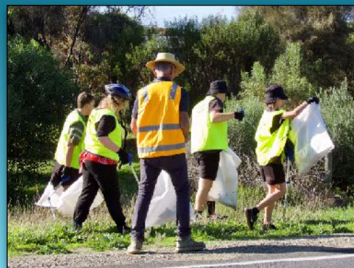
Randell Road Clean-up with Cittaslow volunteers