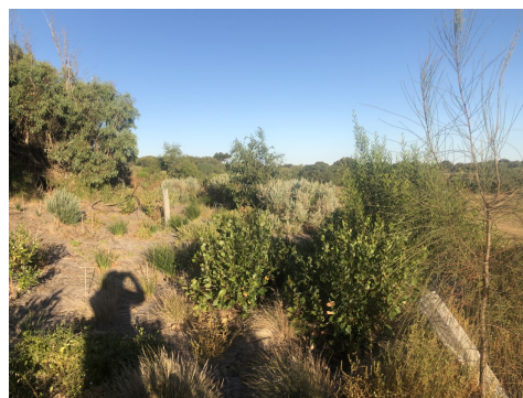
2022 plantings. Great result!

After planting we will light the bonfire and invite you to stay on.