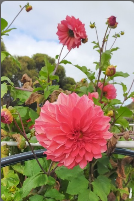
Dina's lovely dahlias

Volunteers have been busy preparing garden beds for winter crops; making good use of the cheap horse manure from our neighbours at Wayandah Park Stud. Winter crops of celery, peas, silverbeet, kale, cauliflower, broccoli, leeks, onions and carrots have been planted.