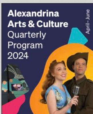
AAACE Program Apr-June 2024