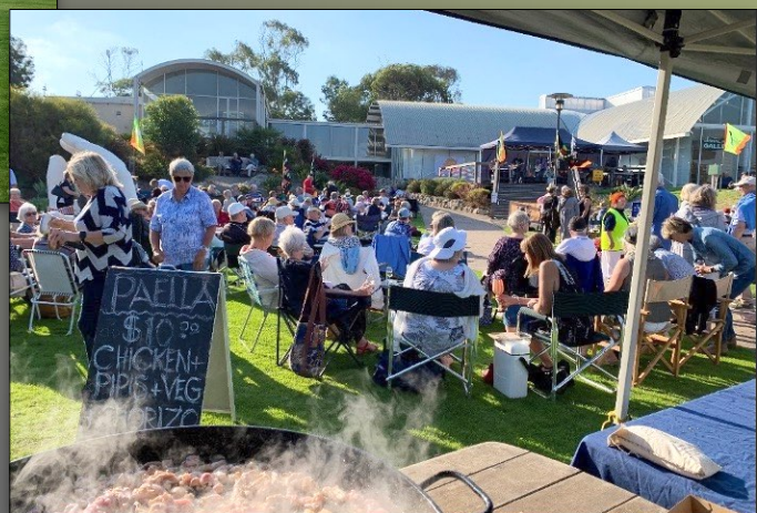
Signal Point in October (but with new deck canopy)!