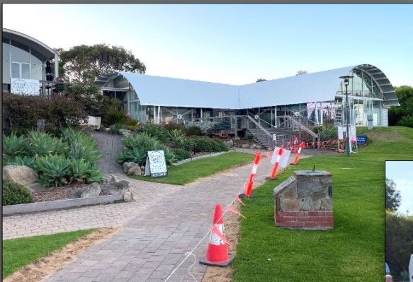
Signal Point now...

Winter appeared to return in November which prompted us to cancel. In December we persevered despite strong winds, with a sizable crowd and many people dancing to keep warm! January produced a cool day but the event was still successful thanks to a new energetic band, 'Slipway', offering a lively range of music. The February date promised to be a warm day and it did not disappoint, but the March long weekend Sunday broke all At The Wharf records! The BOM forecast very high temperatures, and we were aware that many community events were being cancelled. However, past experience suggested that there would likely be a cool change later in the day, and as the last event in a topsy-turvy season, it was decided to push ahead. This turned out to be an unfortunate decision as the heat was even worse than expected and the usual crowds wisely stayed away in droves! Thanks to our hardy team of volunteers rostered on that day, the irrepressible energy of the band Slipway, as well as their families and friends, plus a small group of rusted-on faithful members and supporters, those of us who were crazy enough to brave the high temperatures managed to survive the day in good spirits.