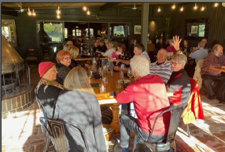
One Paddock Winery Autumn Long Lunch