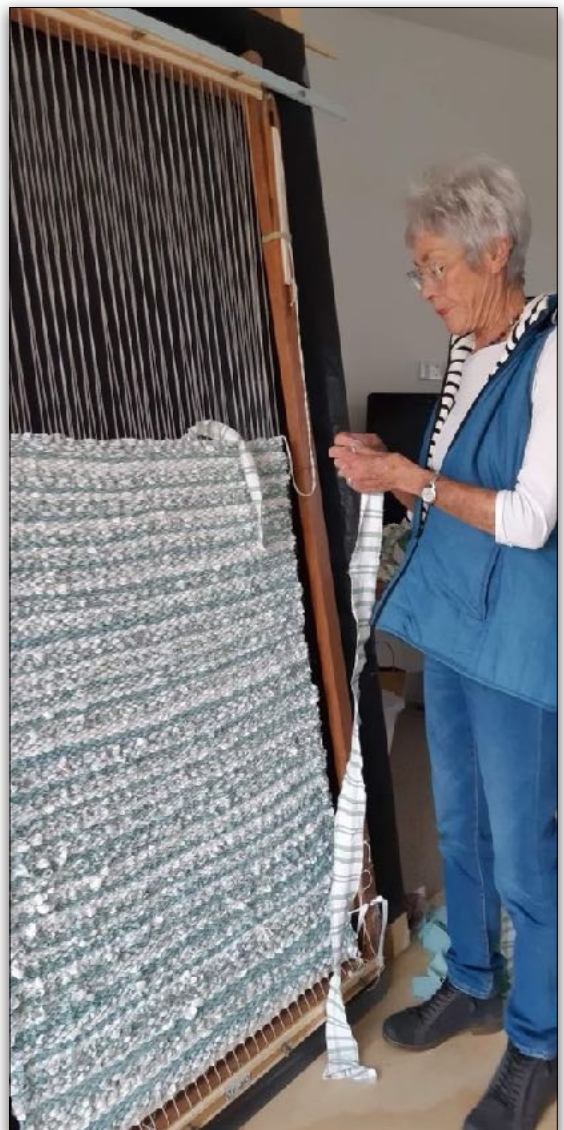
Top: Millicent sesquicentenary woven tapestry