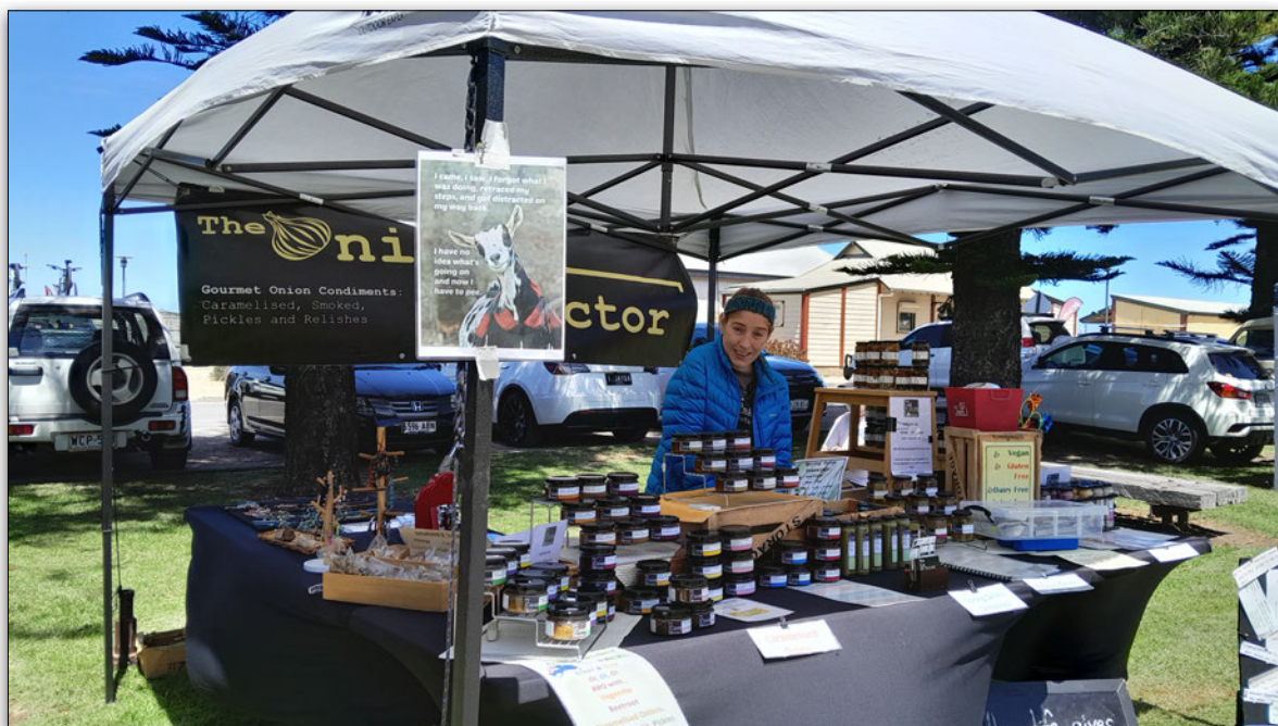
Market stalls on a beautiful sunny Goolwa day. (Note the goat poster)