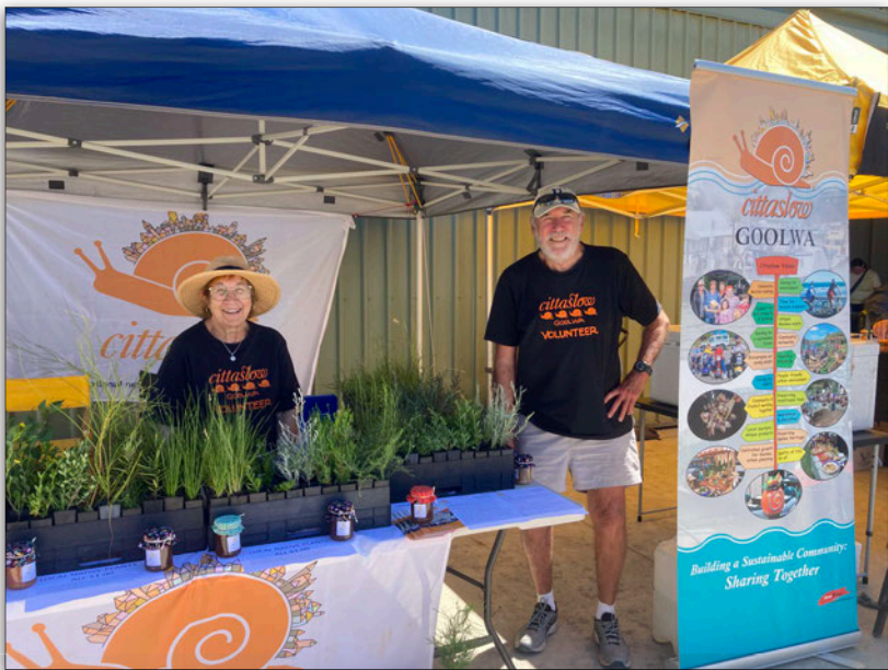
Left: Santopalato Above: Our stall at 'Local Food on Country' event