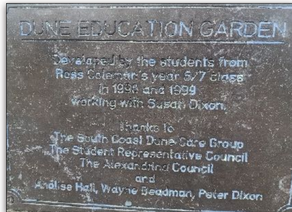
Dune Garden Plaque from 1999