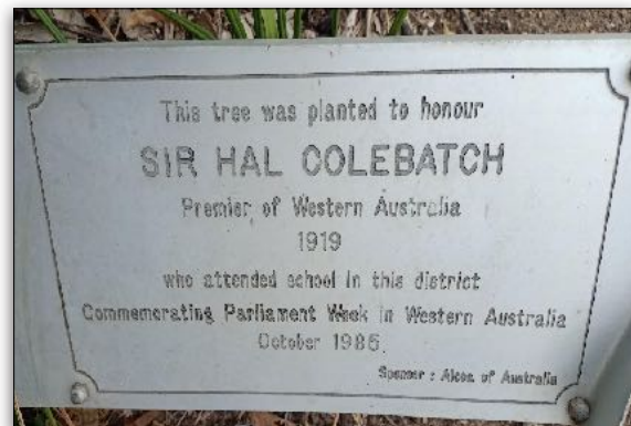
Commemorative plaque, 1985

Late last year, I was exploring a corner of the playground that was overgrown by various weeds and invasive plants when I discovered a plaque. It turned out to be a plaque recognising a famous old scholar. Sir Hal Colebatch had attended Goolwa School in the late 19 th century. He left school at the age of 11 in 1883. He went on to become the Premier of Western Australia. Although he only held the post for a month, he was a major political and public figure for many years. I have identified Hal's plaque and its surrounds as a project for us to revive. The students propagated some Pink Gums ( Eucalyptus fasciculosa ) late last year and would seem an appropriate species to replace the tree referred to in the plaque (long gone). Although not a local species, perhaps some Kangaroo Paw ( Anigozanthos sp) could be added, being WA's floral emblem.