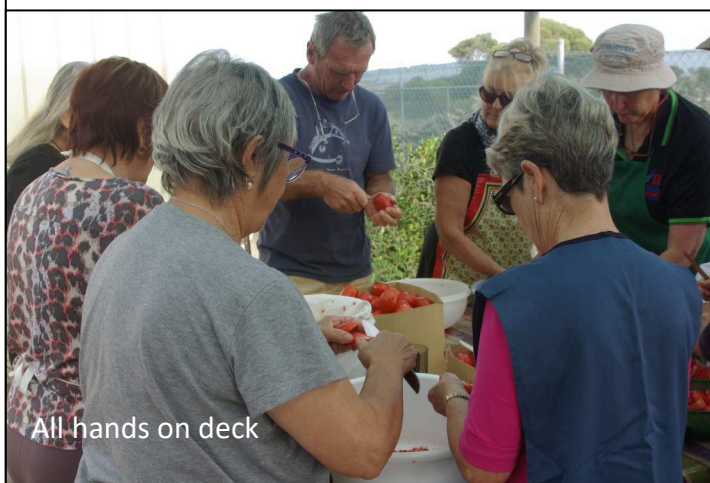
All hands on deck