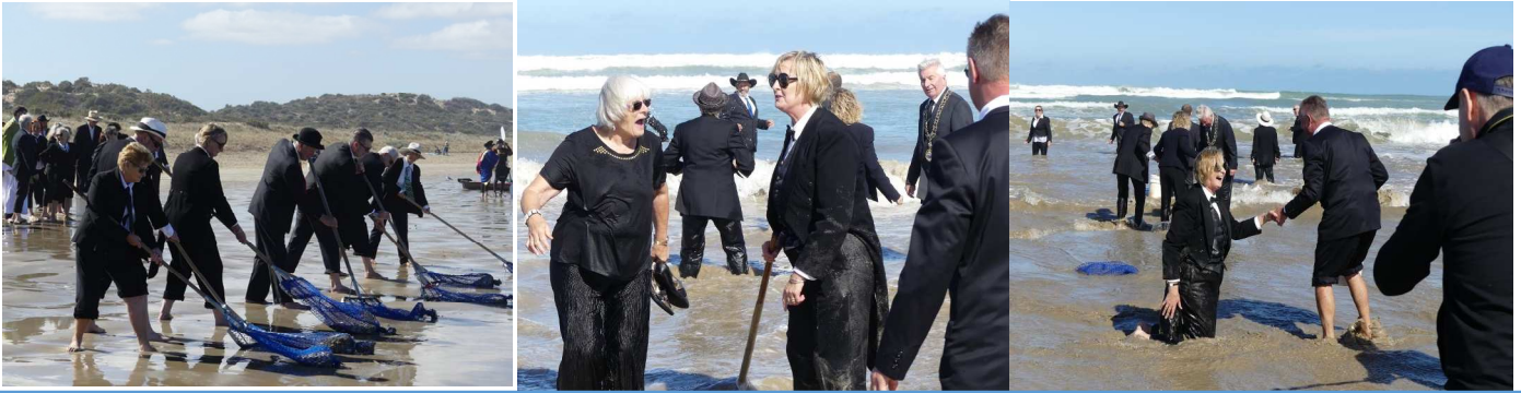
Cittaslow members and friends "cockling" at Goolwa Beach.