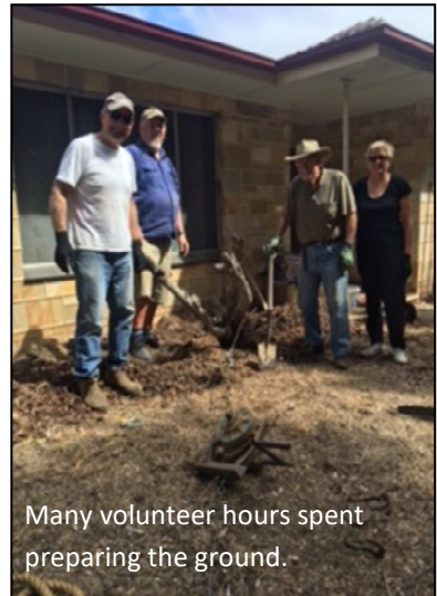
Many volunteer hours spent preparing the ground.