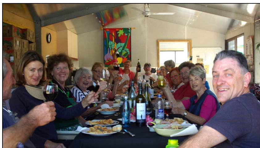
A happy bunch of Cassata makers enjoying the benefits!

Cittaslow Goolwa provides a variety of community events in Goolwa and other parts of the Alexandrina Council area. Although most are available to non-members the best way to stay aware of what is being offered is to be a member check out cittaslowgowa.com.au