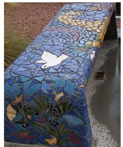
This seat is a sample only taken from the internet.