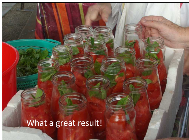
What a great result!

Cittaslow aims to improve quality of life for all residents, business operators and visitors to our region by developing sustainable environmental practices, use of alternative energy, supporting local products and producers, providing unique tourist experiences, preserving our heritage, sharing ideas and encouraging all to take the time to enjoy what we have on offer with family and friends and visitors.